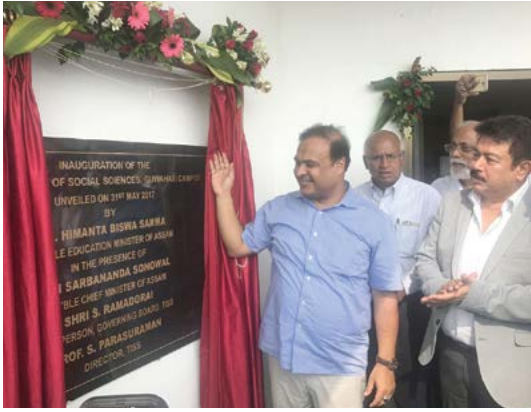
The Inauguration of the new and permanent campus of TISS Guwahati by The Hon'ble Minister of Education, Government of Assam, Dr. Himanta Biswa Sarma on 31 May, 2017.