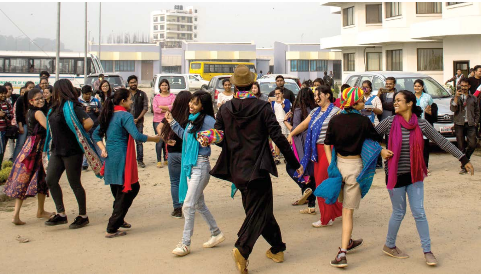
Student activities at TISS Guwahati Campus.

The Centre for Sociology and Social Anthropology (CSSA) aims to integrate the discipline of Sociology and Social Anthropology with a view to have a comparative and systematic understanding of the society and its institutions. The Centre offers an MA programme in Sociology and Social Anthropology (MASSA) which is suited considering the regional location of TISS, Guwahati Campus, where an entire region is on the cusp of a profound social, economic and cultural transformation. This programme in sociology and social anthropology emphasizes interdisciplinary and critical approaches to social issues. It is designed to provide students with the necessary knowledge and basic skills in understanding society and different theoretical orientations.