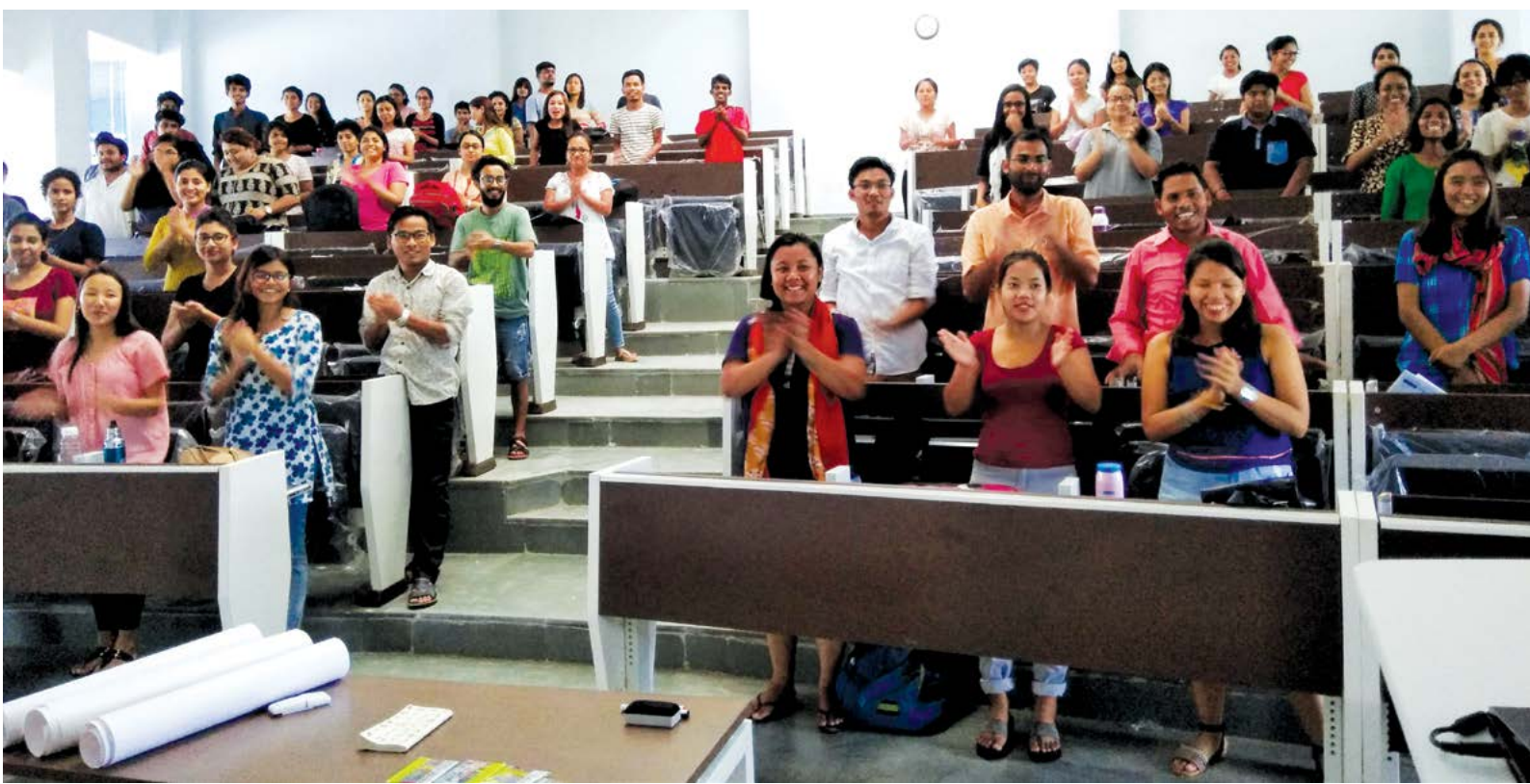
Capacity Building Programme for Students organised by Placement Cell

The Centre for Public Health (CPH) strives for the betterment of public health with the guiding principles of universality and equity. Drawing upon interdisciplinary scholarship, the Centre is envisaged to involve in teaching and learning programmes, innovative research and policy engagements in North east India as well as national level. Presently, the Centre offers two-year MA Social work in Public Health programme. Social work in public health programme aims to equip students with an understanding of health systems as well as health problems so that they enhance their knowledge of health realities. The programme also aims to develop evidence-based, context-specific and resource-sensitive practitioners of public health. Further the course aims to build the capacities and skills of students to enable them to analyse health issues and problems at micro, meso and macro levels. Dissertations of students reflect their understanding on health Systems, health problems , health Programmes and Schemes. In the year under review , the students of this centre have conducted their field work in hospitals, NGOs that work on health, Psychiatric institutions as well as in relation to Corporate Social Responsibility initiatives in health care.