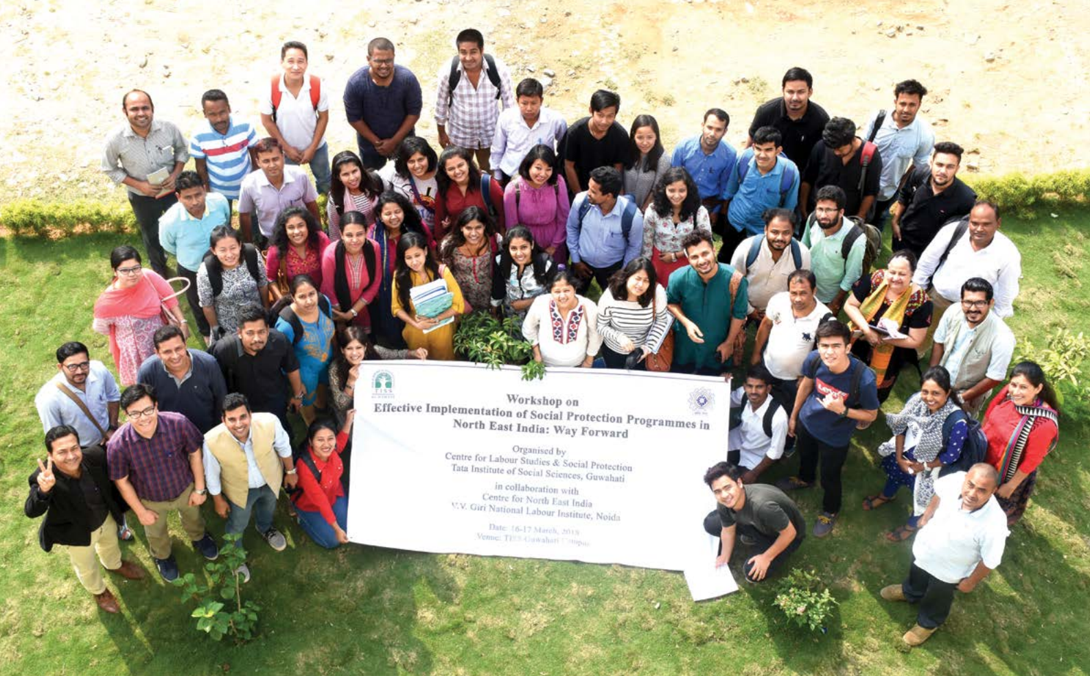
Workshop on 'Effective Implementation of Social Protection Programmes in North East India: Way Forward' organised by the Centre for Labour Studies and Social protection, TISS Guwahati Campus in collaboration with the Centre for North east India, VVGNLI on 16-17 March, 2018.