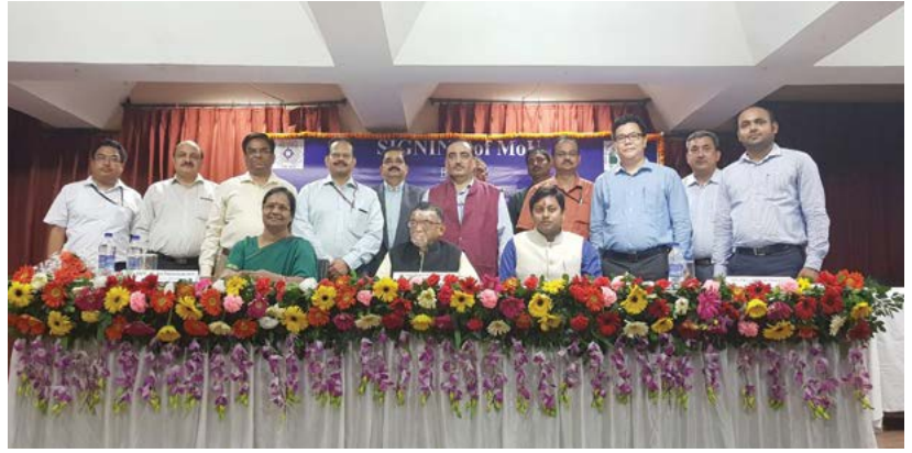
Signing of MoU ceremony between Centre for Labour Studies, TISS Guwahati Campus and V.V. Giri National Labour Institute, Ministry of Labour and Employment, Government of India in the presence of Shri Santosh Kumar Gangwar, Hon'ble Minister of State for Labour and Employment, Government of India; and Shri Sarbanand Sonowal, Hon'ble Chief Minister of Assam and Shri Pallab Lochan Das, Hon'ble Minister of State for Labour Welfare, Assam on 6 October 2017.