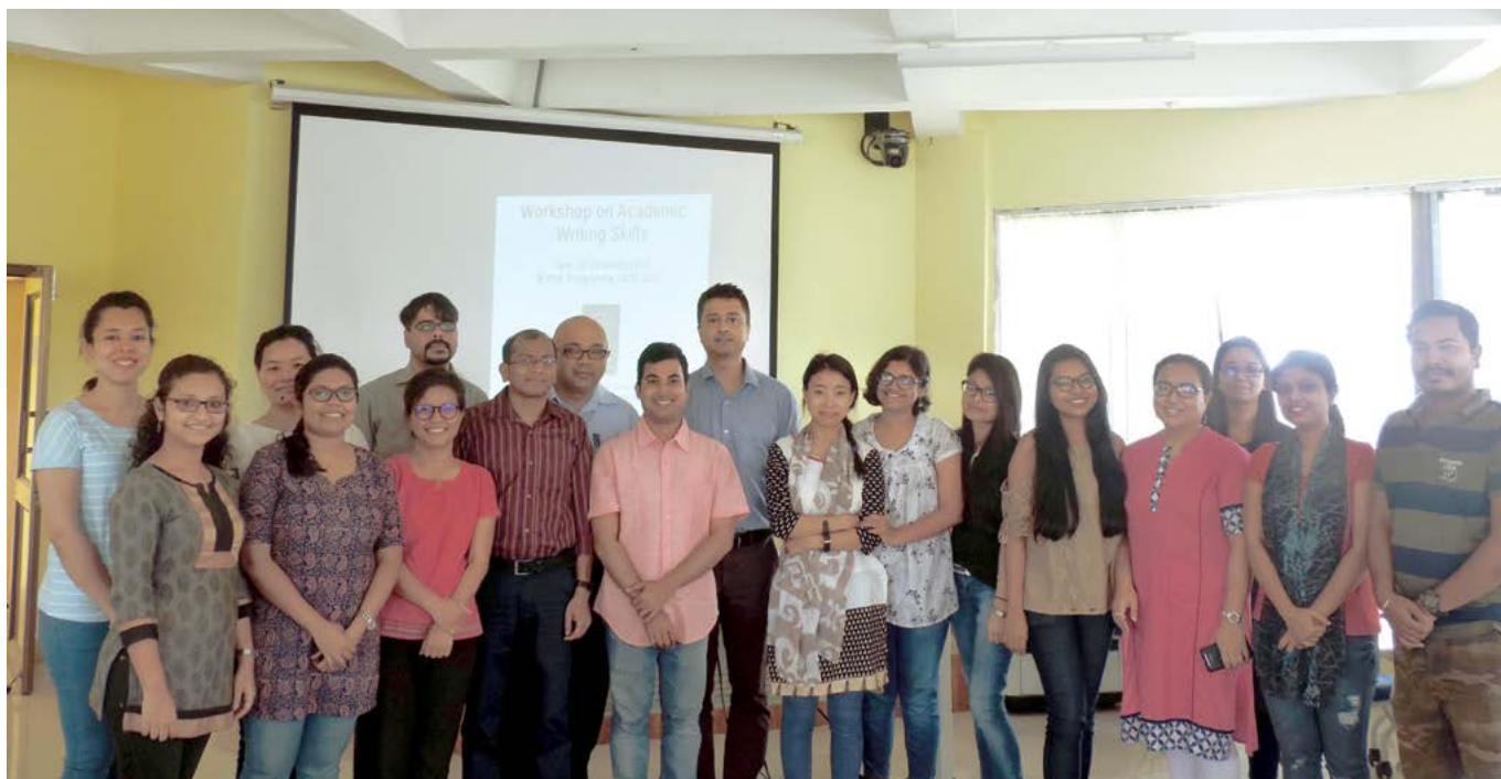
Workshop on 'Academic Writing Skill' for Research Scholars organised by Unit for Research and Development, TISS Guwahati Campus during 20-23 March, 2018.