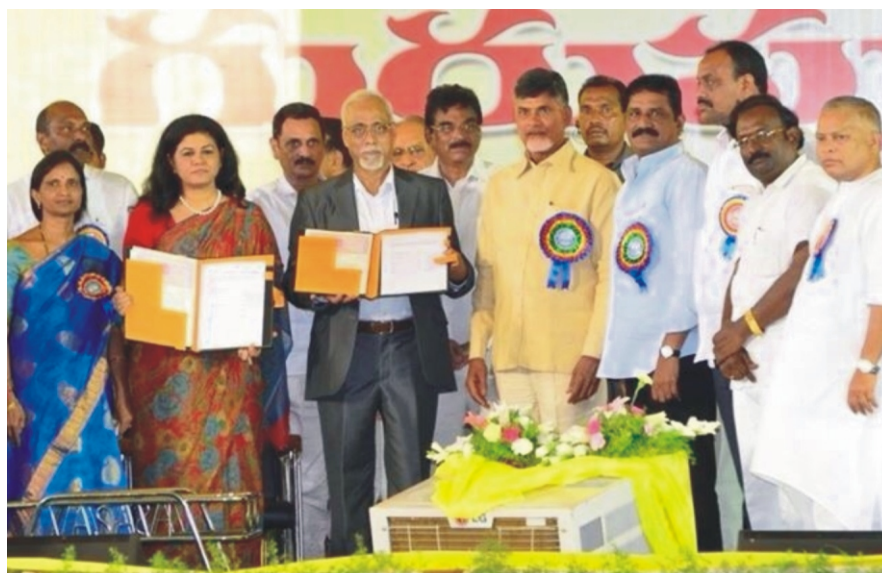
TISS enters into an MoU with Govt of Andhra Pradesh on 5th September 2015 to implement 'Andhra Pradesh University Students Employability Skill Development Programme

This annual report covers the various milestones and key achievements that the Institute has garnered across its major areas of work, i.e. teaching, research and outreach on the one hand and its four major constituencies: Students, Faculty, Alumni and Employers (State Governments, NGOs and Business).