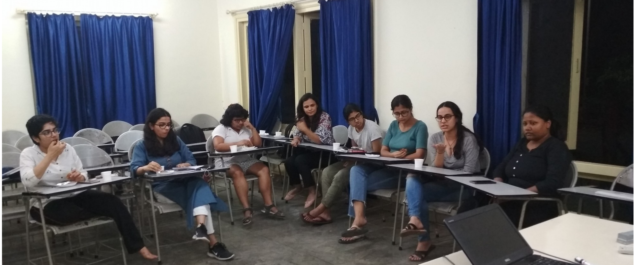
Students engaged in a discussion about gender sensitivity on campus

The session generated various actionable solutions and the Gender Advocates enthusiastically taking on responsibilities that will help make the university a more inclusive and gender friendly space.