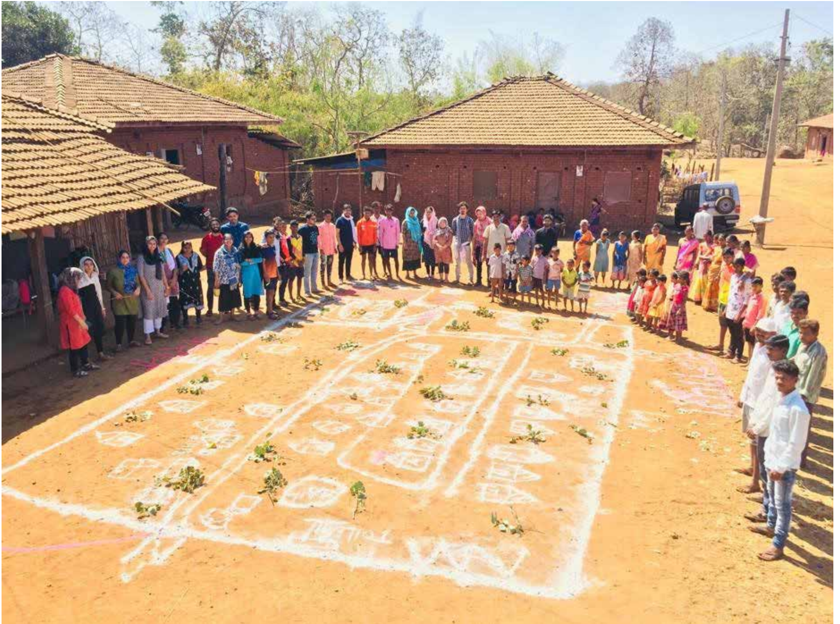
Community Mapping at Borla Pada by Social Work Public Health students