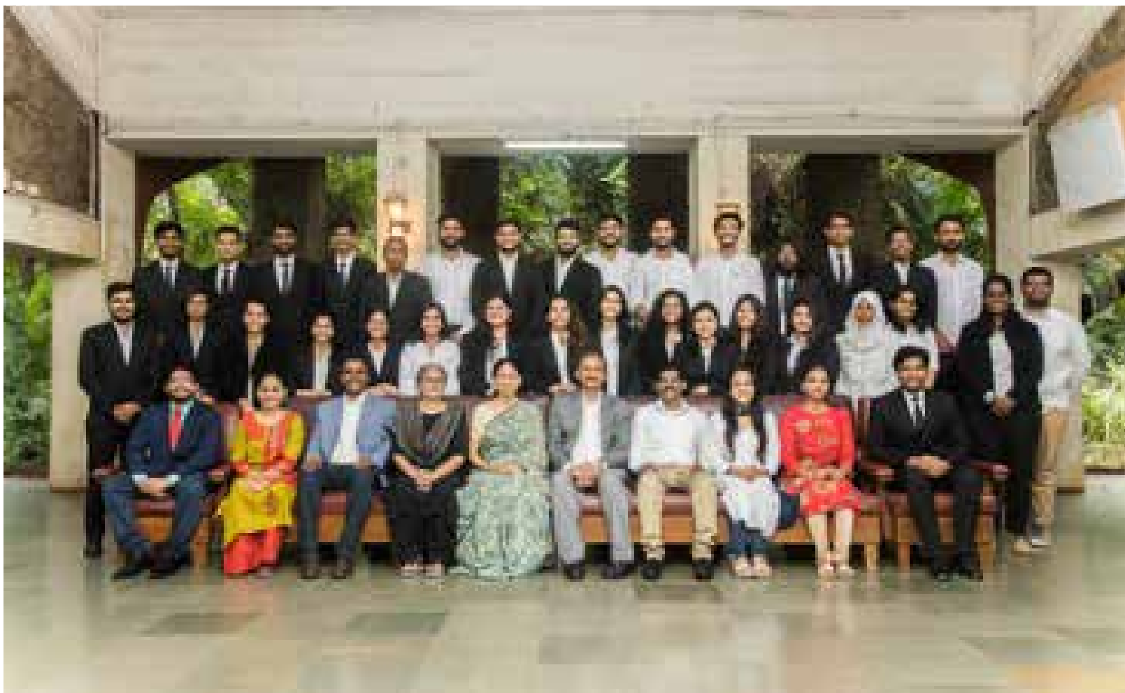
Students of the School of Law, Rights and Constitutional Governance

links with other researchers, policy makers and practitioners involved in policing research in particular and criminal justice system at large. The Centre provides credit and non-credit teaching and training courses and workshops for the law enforcement and security communities: State police departments across the country, Central forces (BSF, CISF, CRPF, etc.) and the academia.