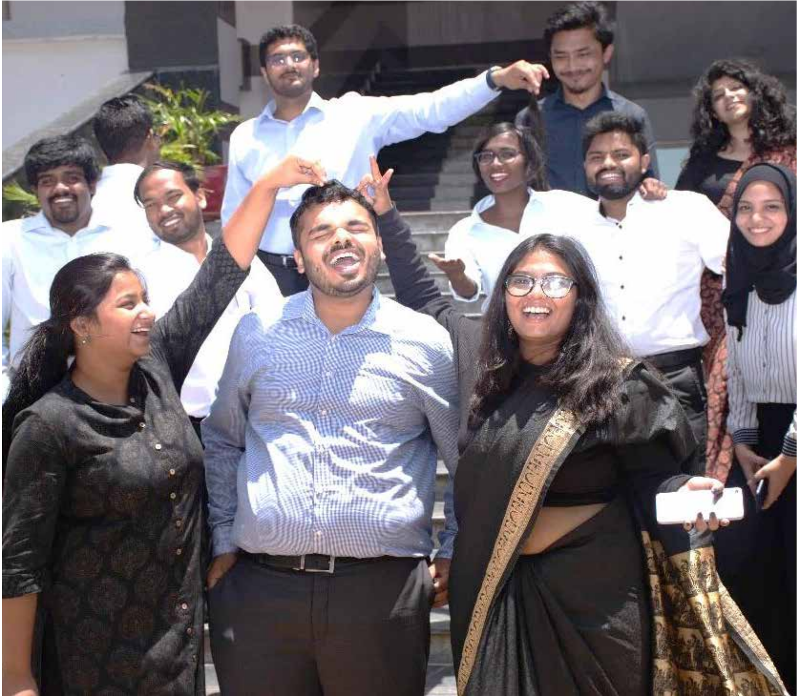
Students from the Batch of 2018-20