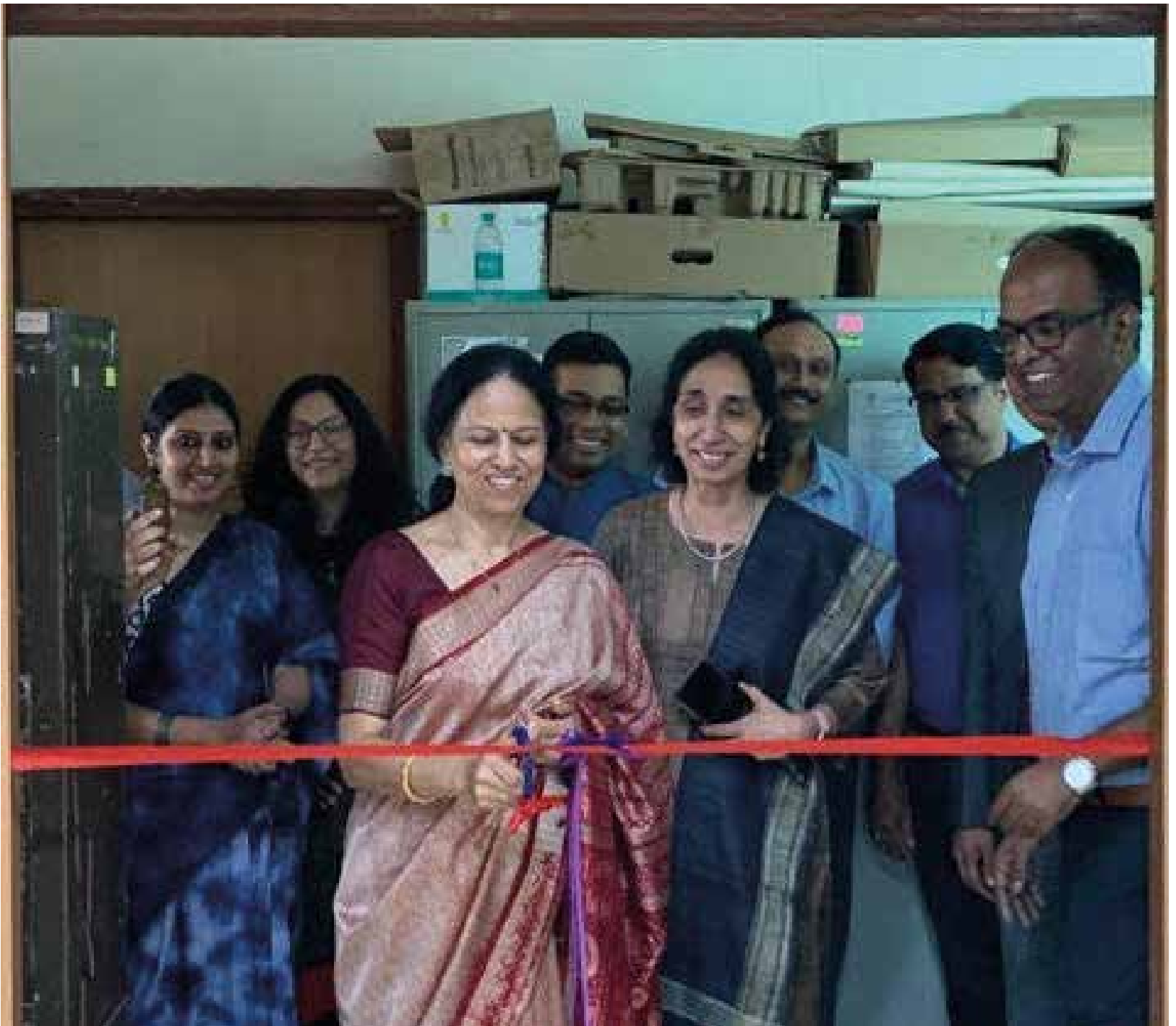
Inauguration of the State of the Art Virtual Studio Facility