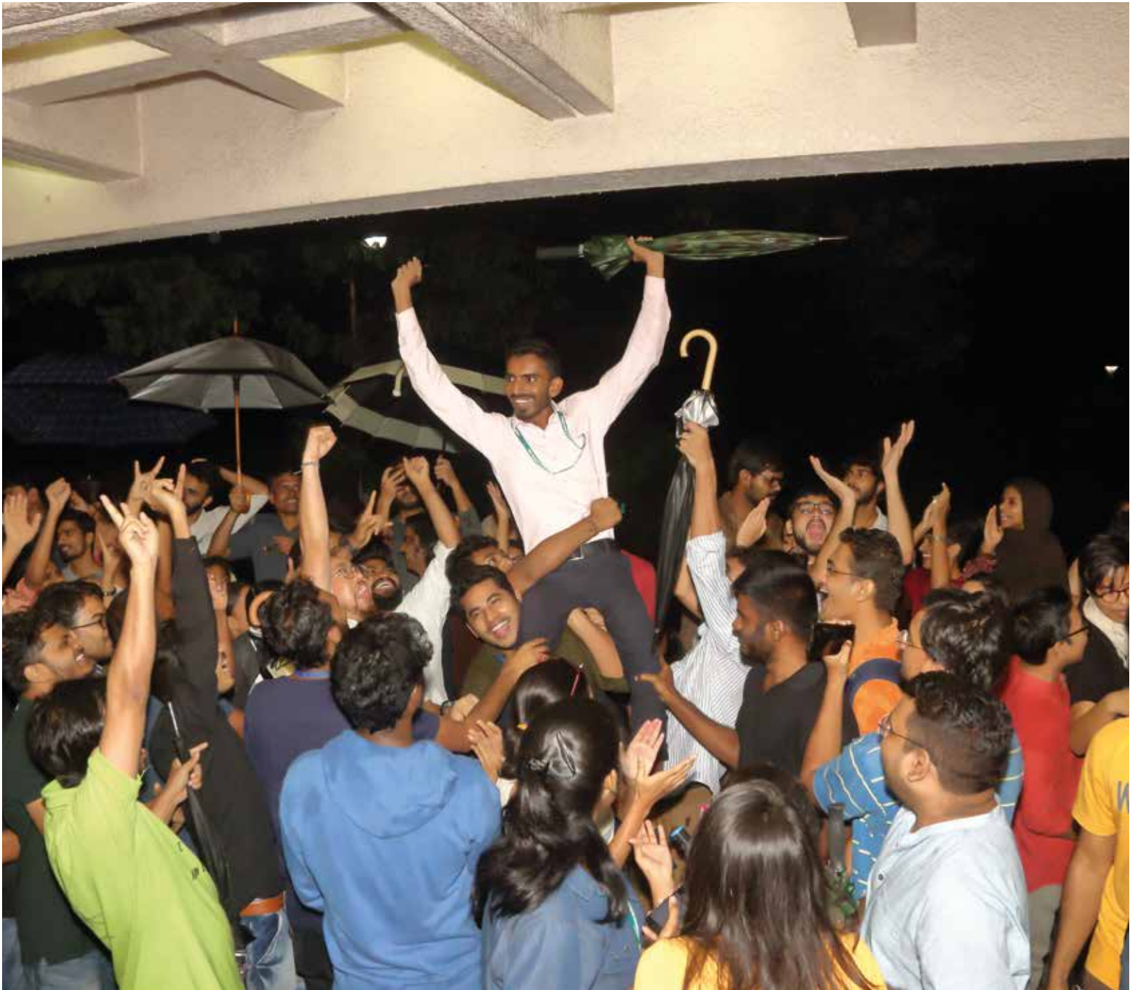
Emotions run high as results of the Students' Union, 2019-2020 election results are announced