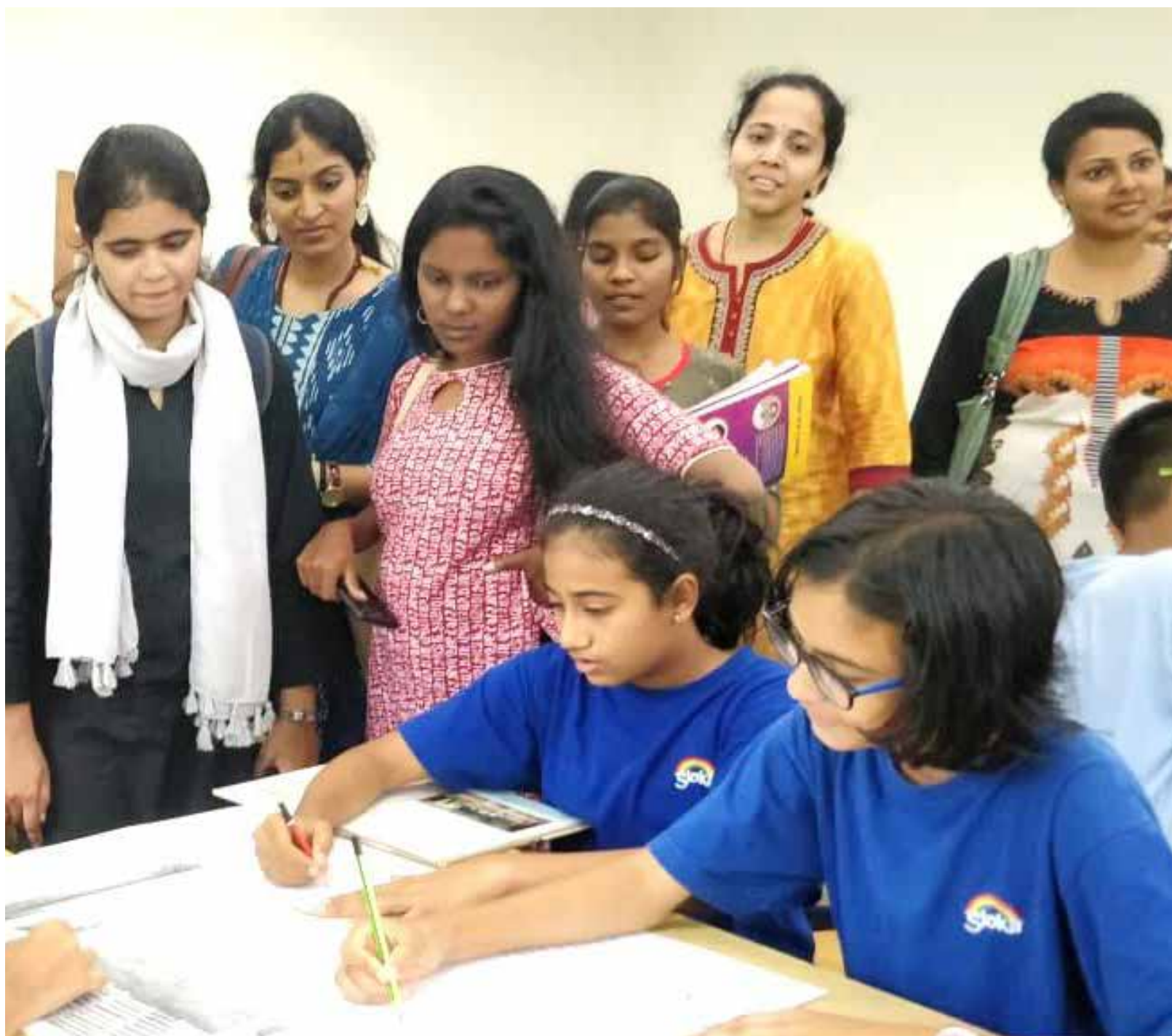
Understanding the Field of Education: Experiential Learning