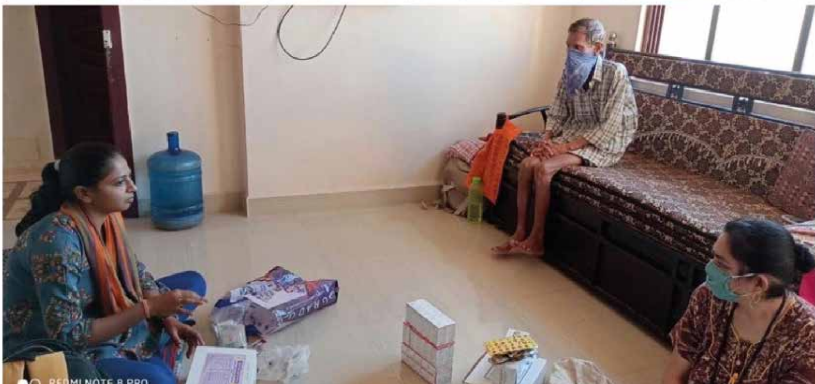
Saksham Counsellors at Work in the times of the COVID-19 Pandemic