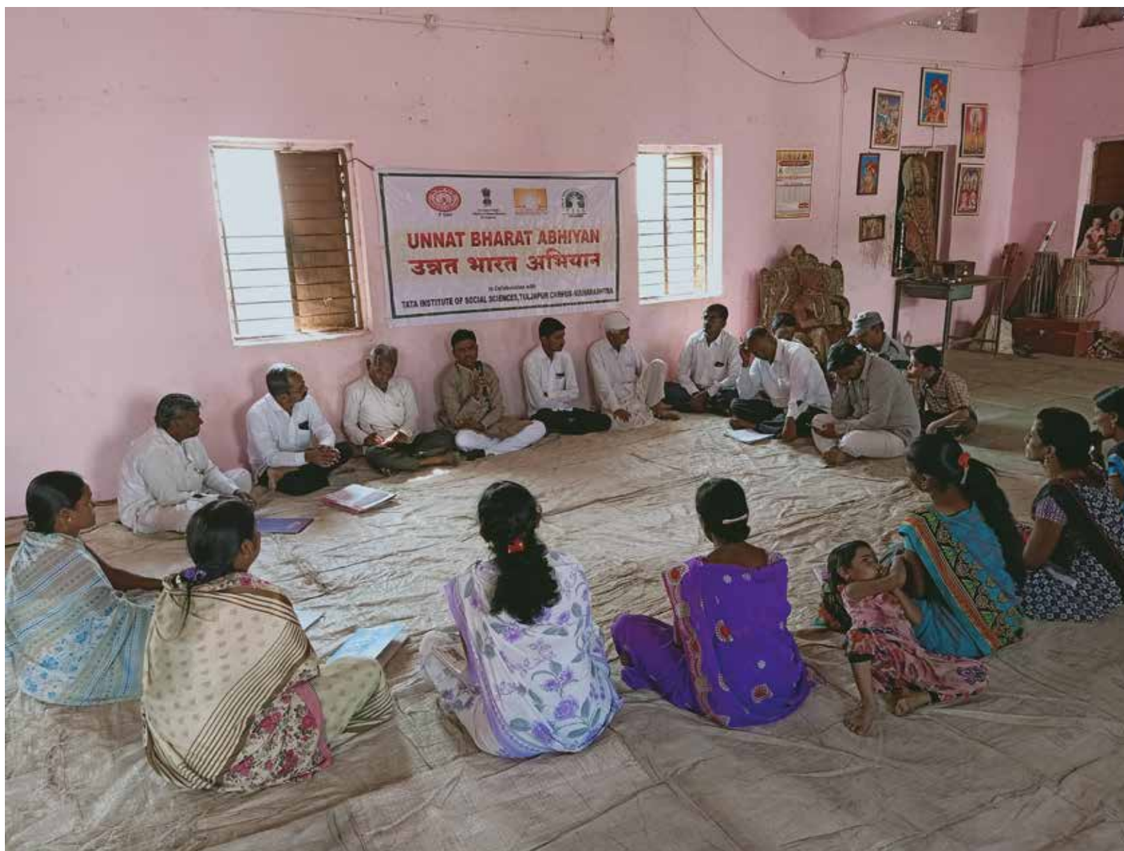
Village community at an Unnat Bharat Abhiyan Meeting