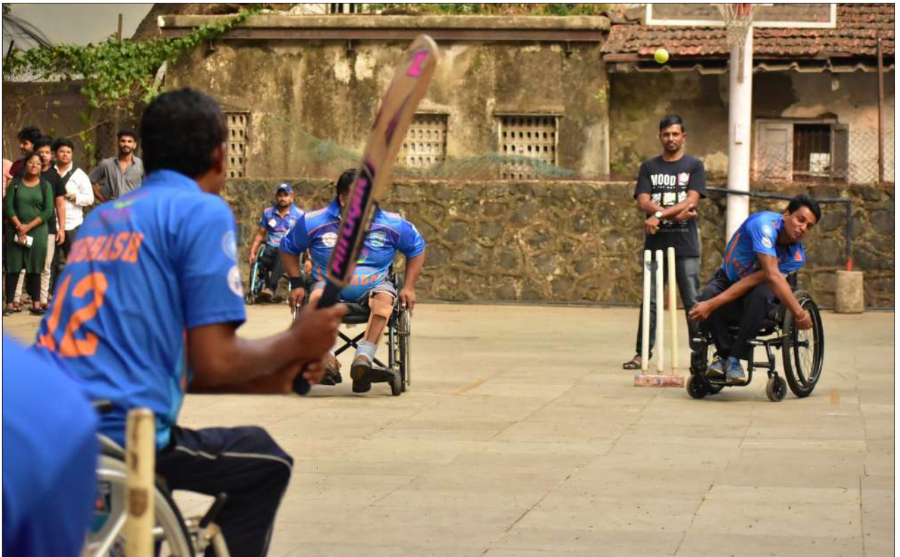
Wheelchair cricket match to commemorate World Disability Day at TISS Mumbai