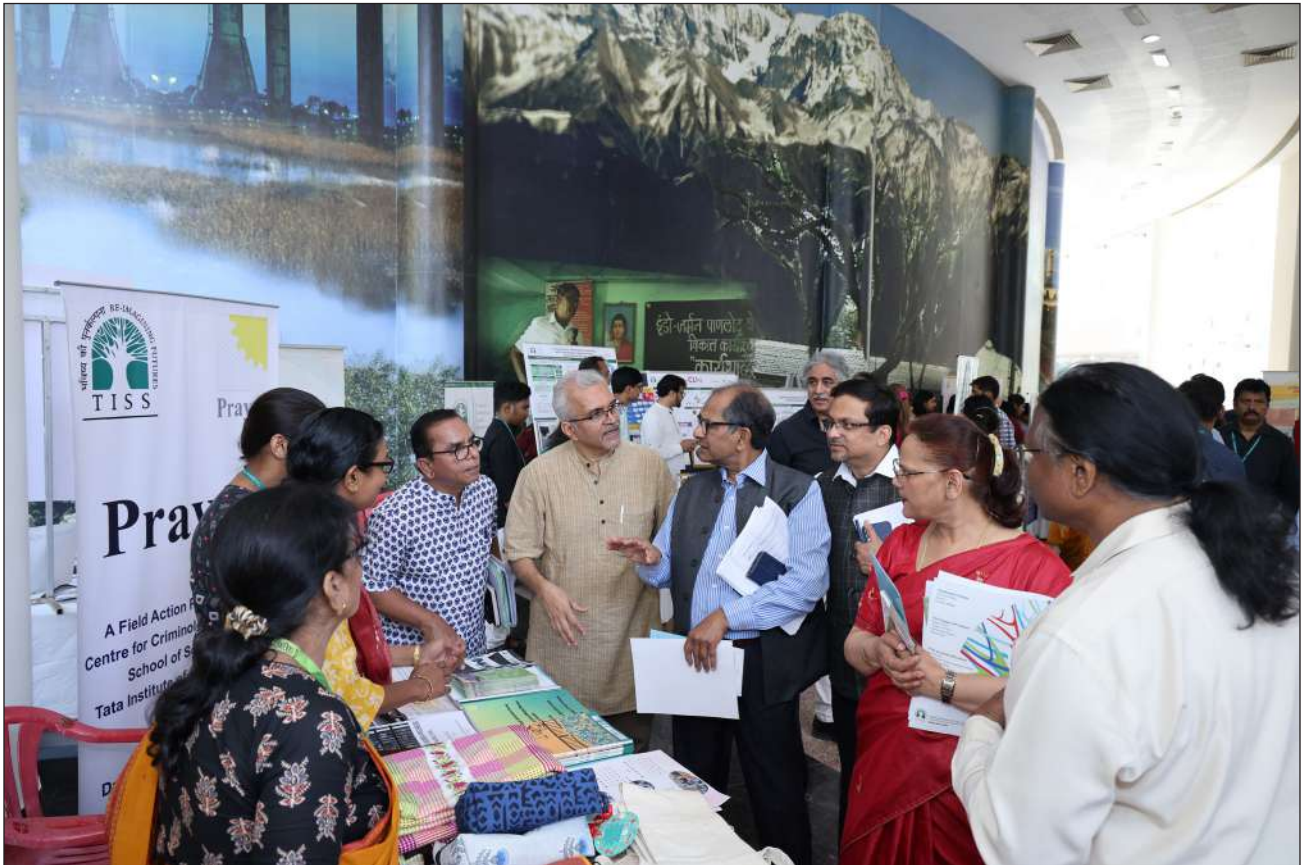
The NAAC Expert Team interacts with the team from Prayas (a Field Action Project of the School of Social Work, TISS Mumbai) during their visit in February 2024

TISS was declared as a Grade One University bearing a letter grade A+ with a score of 3.33 in the National Assessment and Accreditation Council (NAAC) rating in February 2024. It was also placed in the top 100 in the National Institutional Ranking Framework (NIRF) .