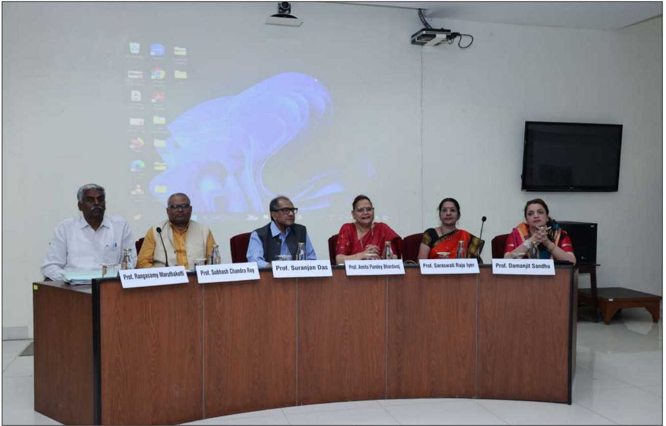
NAAC Expert Team at the TISS Mumbai Campus, 26-28 February 2024