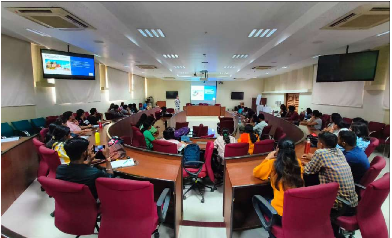
DAAD Information Session at TISS Mumbai