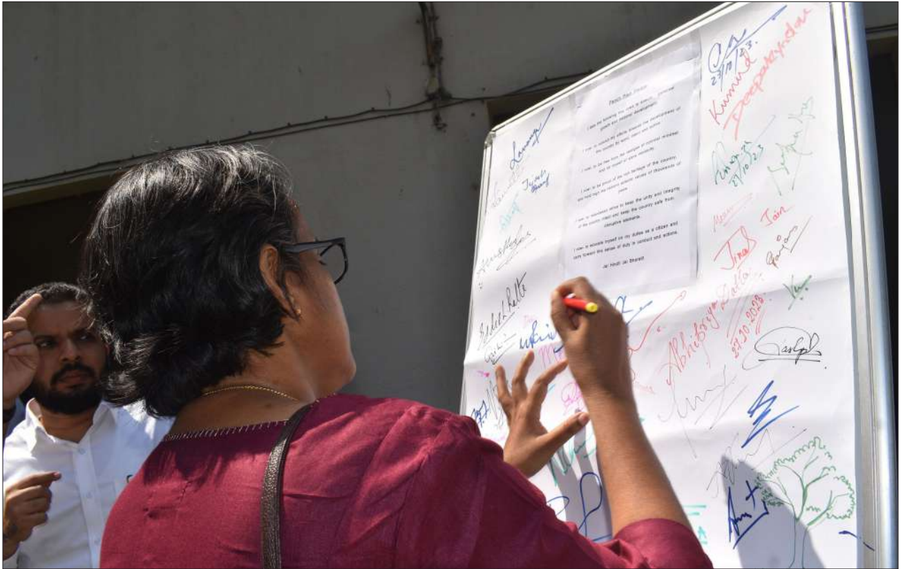
Meri Maati, Mera Desh campaign at TISS Mumbai.