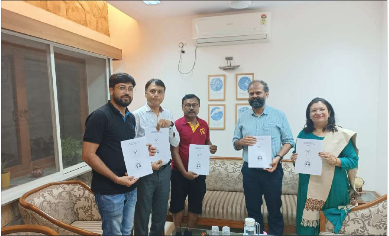
Signing of MoU with Yali Mobility on 5 December 2023