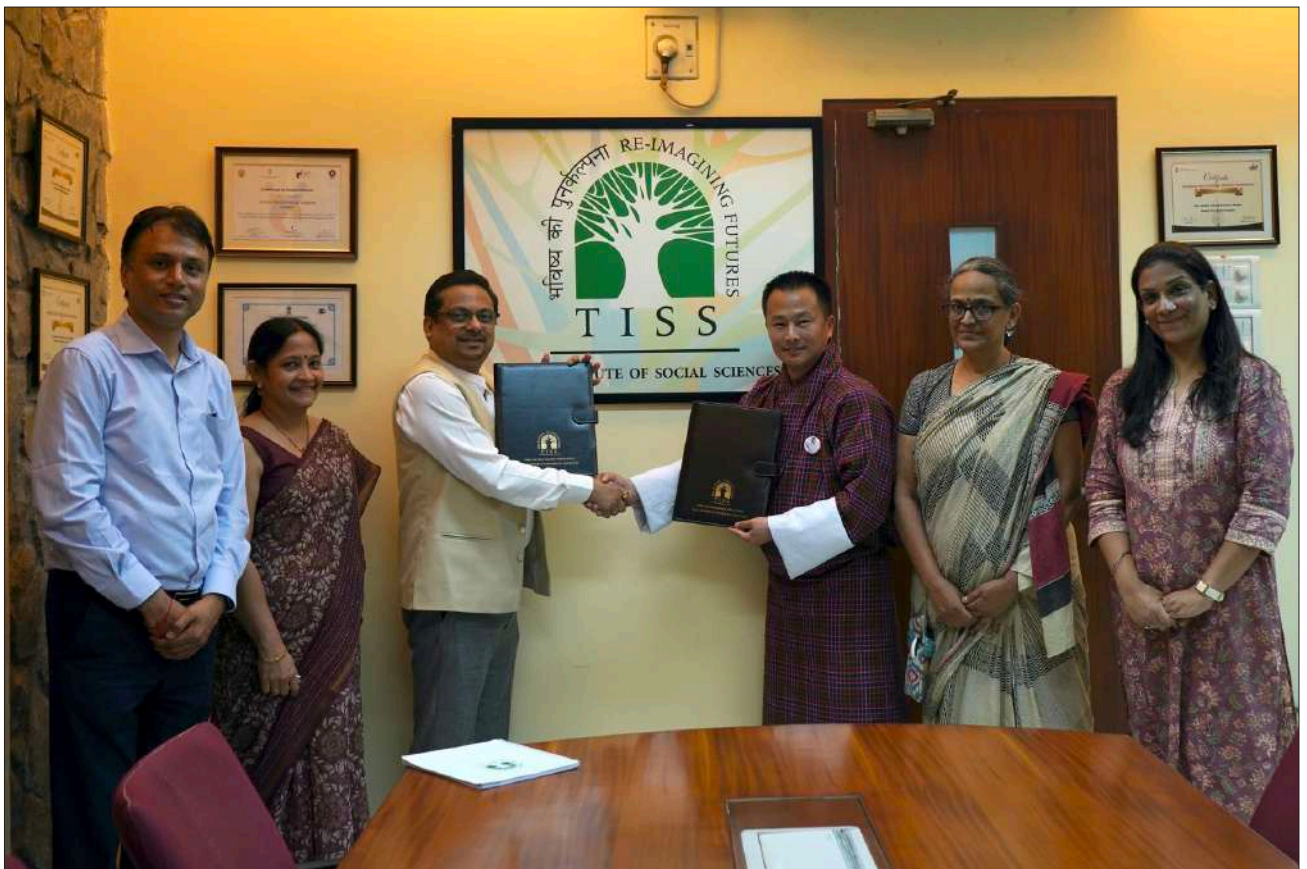
Signing of MoU with the Teacher Development Division, Department of School Education, Government of Bhutan