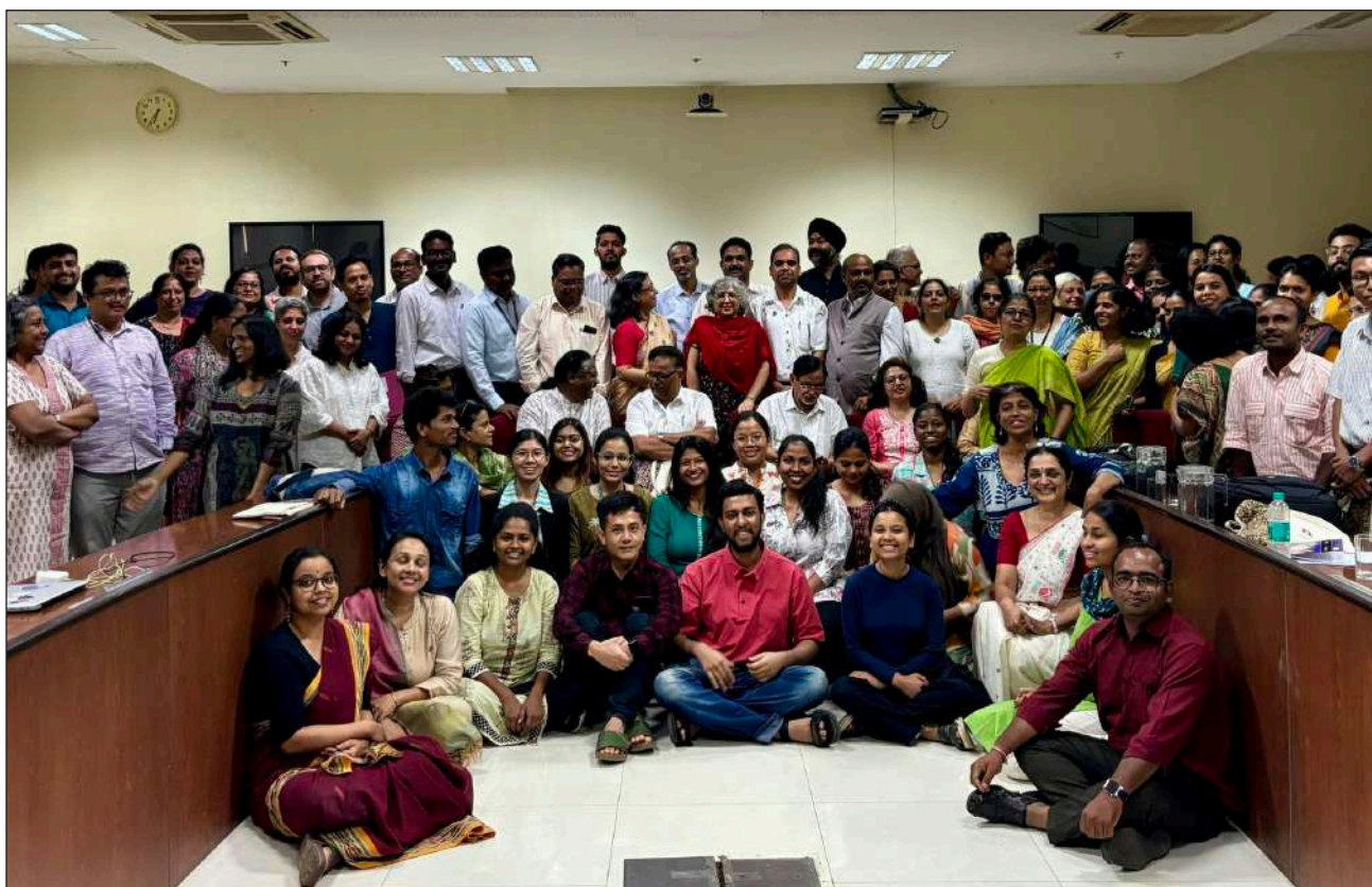
Participants of the National Conference on “Fieldwork in Social Work Education: Dimensions in Practice Education Experiences from Fieldwork”