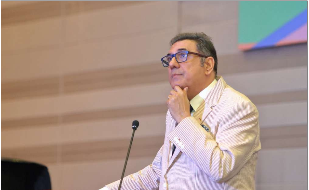
Mr. Boman Irani, Chief Guest for Institute Day 2024, addressing TISSians at the Convention Centre