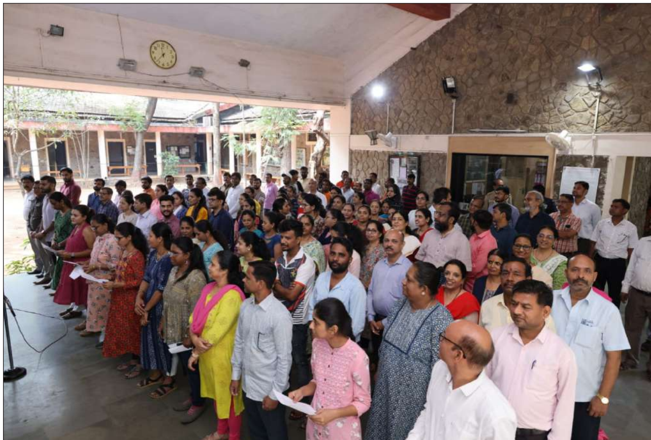
TISSians taking the oath to “preserve the unity, integrity and security of the nation” on the occasion of Rashtriya Ekta Diwas.