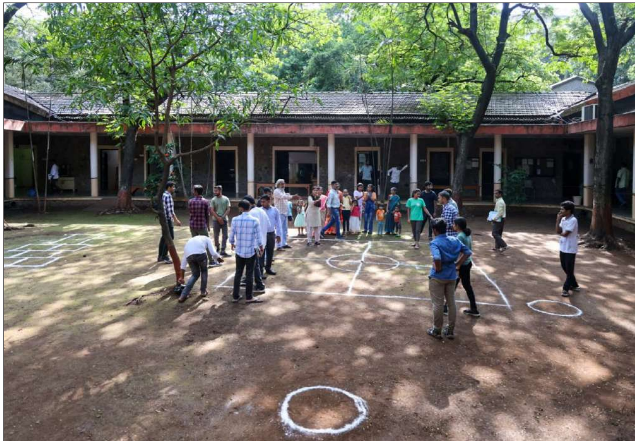
National Sport Day celebrations at the Main Campus, TISS, Mumbai

On 5 June 2023, the TISS Tuljapur Campus celebrated World Environment Day by planting saplings of 29 local species over a 0.40 hectare area.