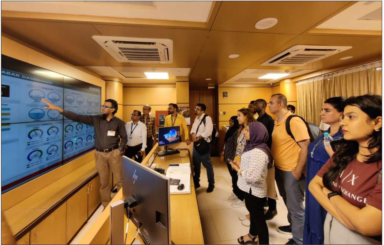
ITEC participants learn about Municipal Government's role in Social Development