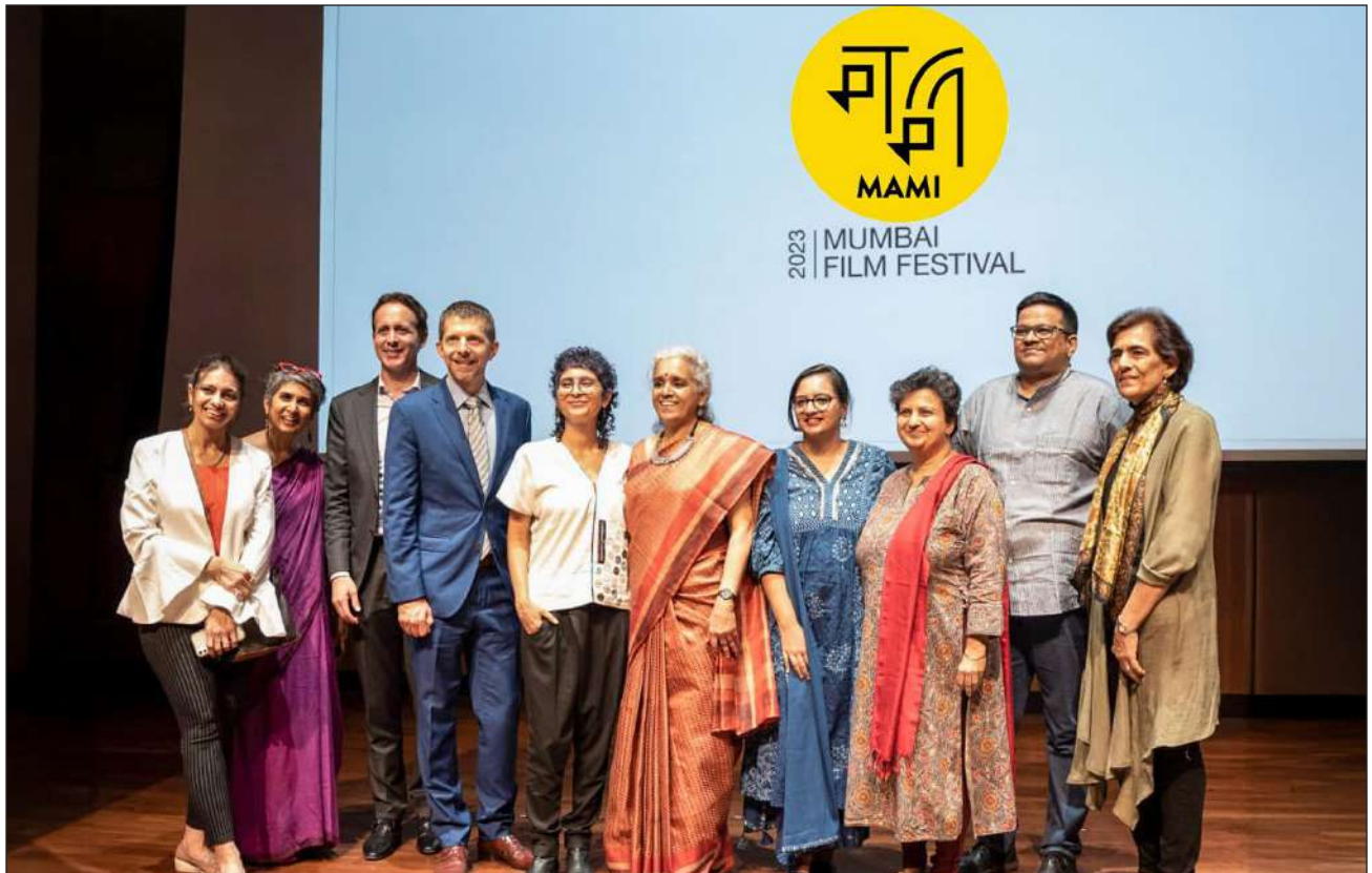
Faculty members from the School of Media & Cultural Studies and dignitaries at the Jio MAMI Film Festival to present their research on "Gender Representation on Screen and Behind the Screen"