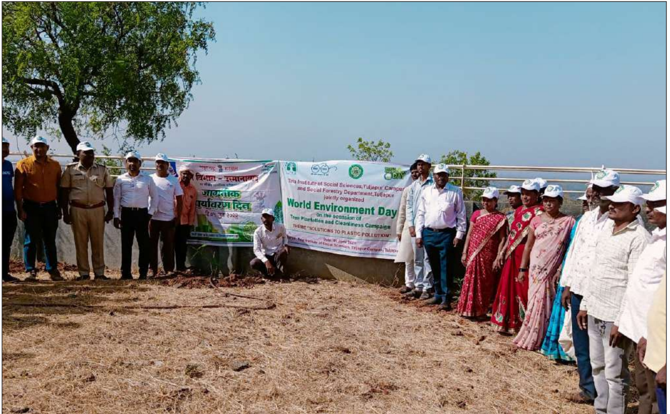
World Environment Day celebrations at the TISS Tuljapur Off-Campus.