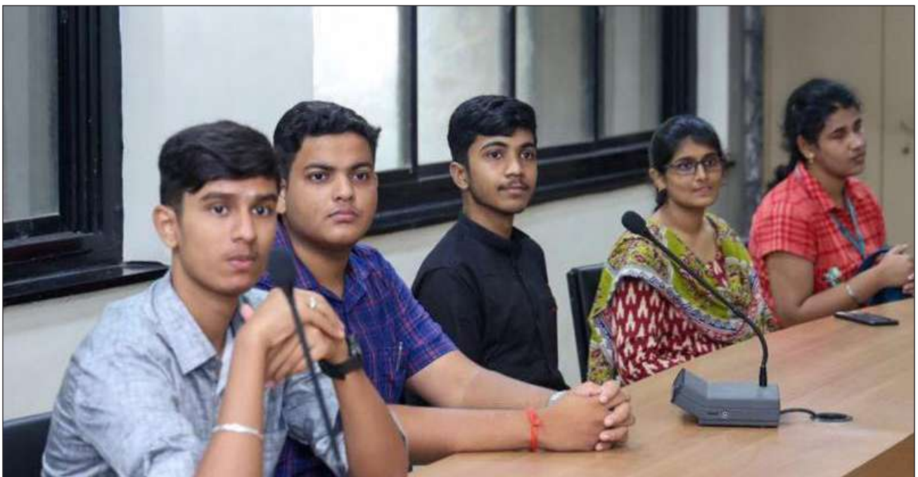
Eager, young faces at the inaugural session of the Bachelor of Social Work programme at TISS Mumbai on 4 September 2023.

TISS is partnering with Sciences Po (Paris) to offer an International Dual Master's Degree Programme in Global Urban Development , which will begin in the academic year 2024–2025. The Urban School of Sciences Po (Paris) and the School of Habitat Studies of TISS Mumbai, will administer the programme.