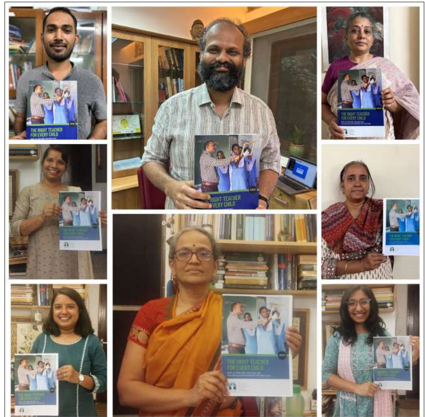
(Left): At the virtual release of the release of The Right Teacher For Every Child, the State of Teachers, Teaching, and Teacher Education Report For India 2023

The Indian Journal of Social Work (IJSW) , the Institute’s flagship publication is now in its 85 th year of uninterrupted and continuous publishing on since June 1940. It is indexed and abstracted in 12 worldwide databases, including Scopus. The IJSW is also part of the elite Group 2 UGC Care List, by virtue of being indexed in Scopus.