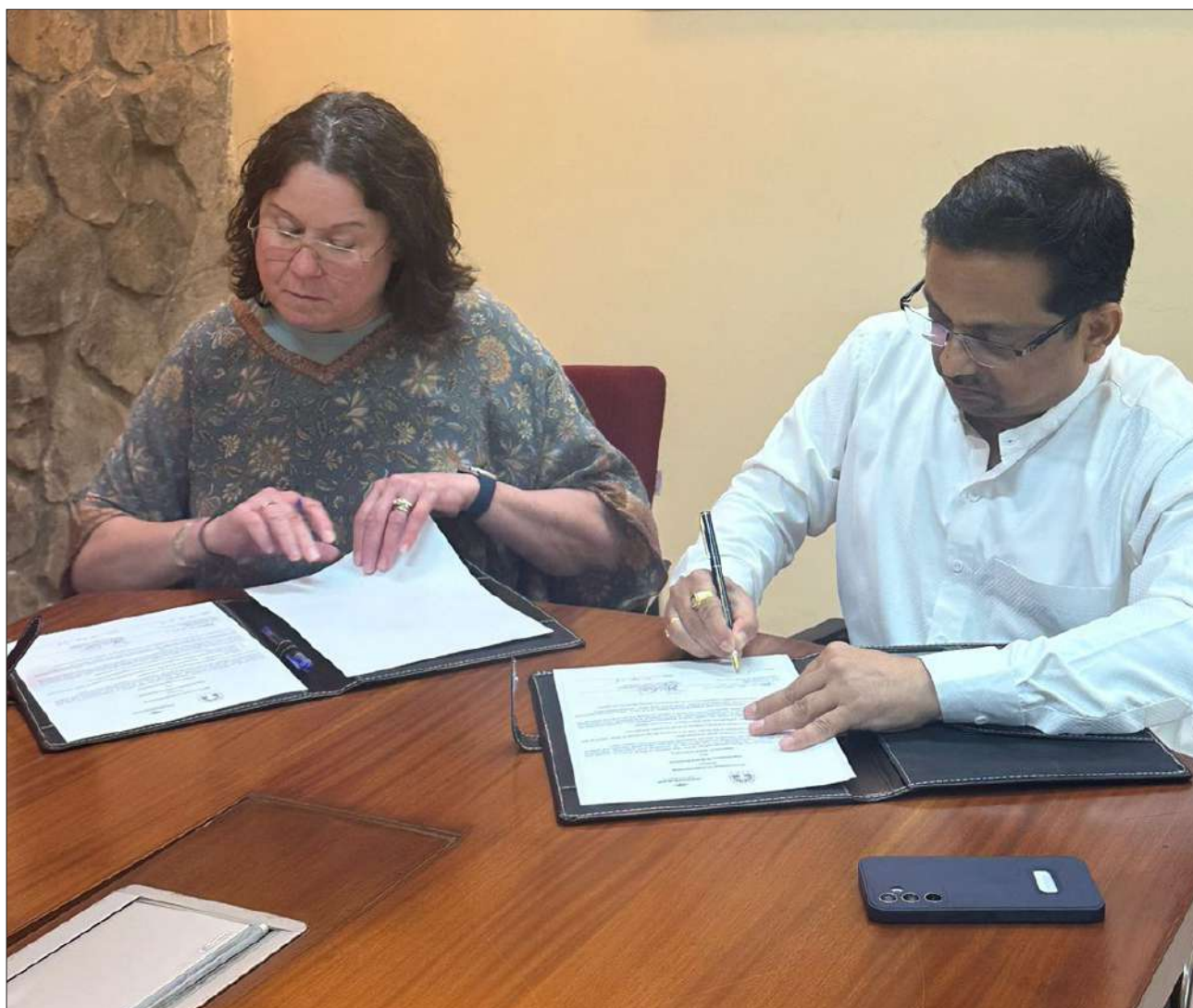
MoU with Vancouver Island University on 12 April 2024

The School of Educational Studies, TISS Hyderabad Off-Campus, and the Centre for Training and Capacity Building signed an MoU on 20 June 2024 with the Council for the Indian School Certificate Examinations (CISCE) to empower school heads to enhance their leadership skills through training.