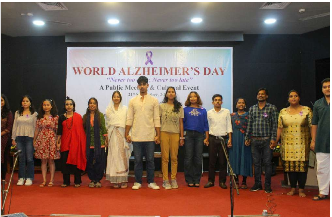
World Alzheimer's Day celebrations at the TISS Guwahati Off-Campus.