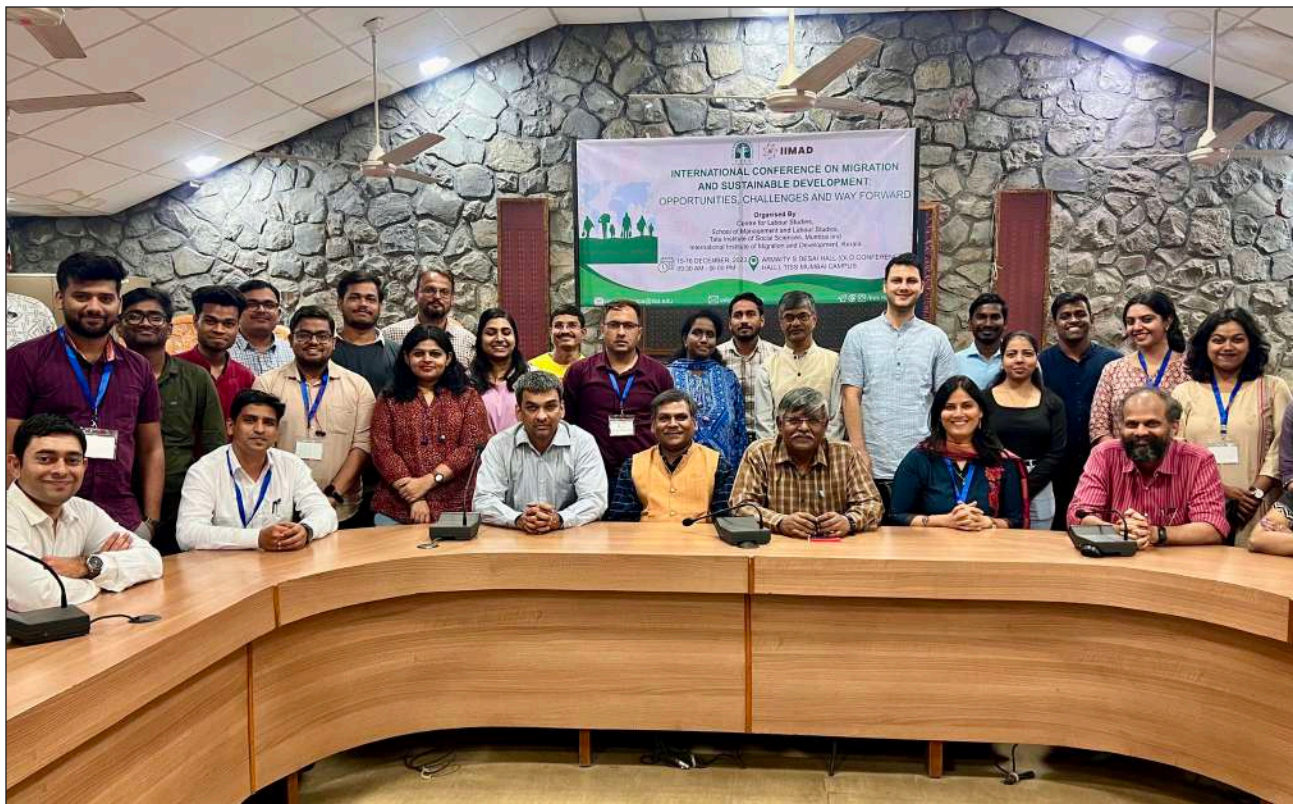
Participants of the International Conference on “Migration and Sustainable Development: Opportunities, Challenges and the Way Forward”