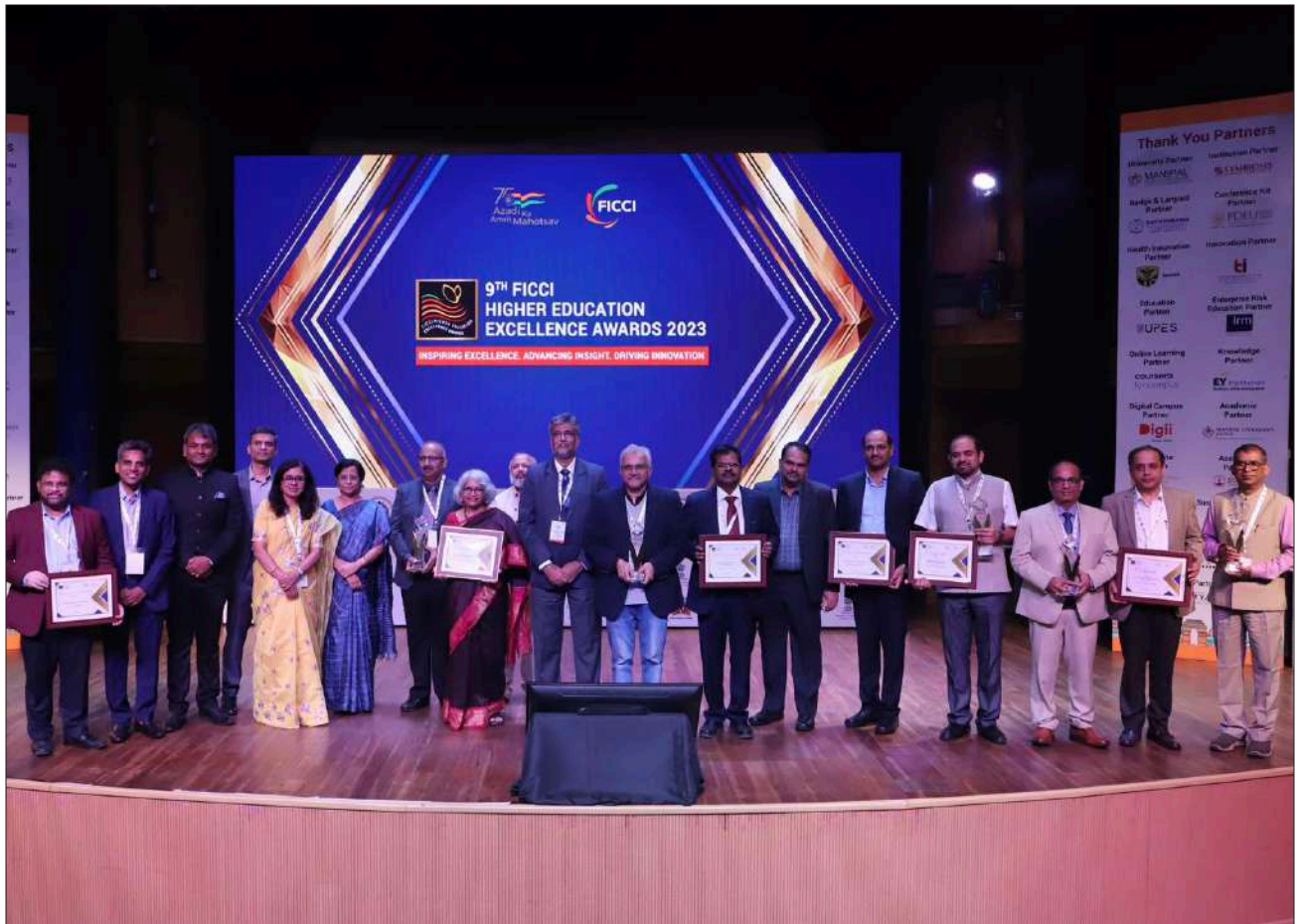
At the FICCI Higher Education Excellence Awards 2023, where the School of Social Work, TISS Mumbai, won in the category of Institutional Social Responsibility