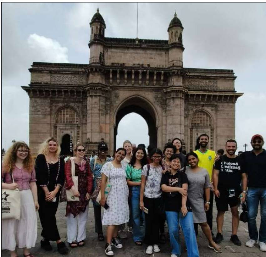
New international students discovering Mumbai

Cities Research and Innovation Network (ASCRIN) in 2023. ASCRIN is an interdisciplinary collaborative network that connects researchers, public sector professionals, and business leaders with expertise to work together to improve Asian cities. The network aims to enhance the sustainability, liveability, and efficiency of cities across Asia through practical, existing technologies. The network includes other premier institutions in India, such as the Indian Institute of Technology-Kanpur and Birla Institute of Technology & Science (Pilani), along with partners like the Smart City Mission under the Ministry of Housing and Urban Affairs (GoI), and Global Victoria, State Government of Victoria, Australia.