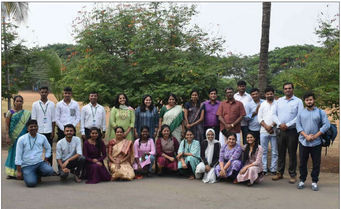
Founder's Day celebrations with the Pragati (a Field Action Project of the School of Social Work) Team