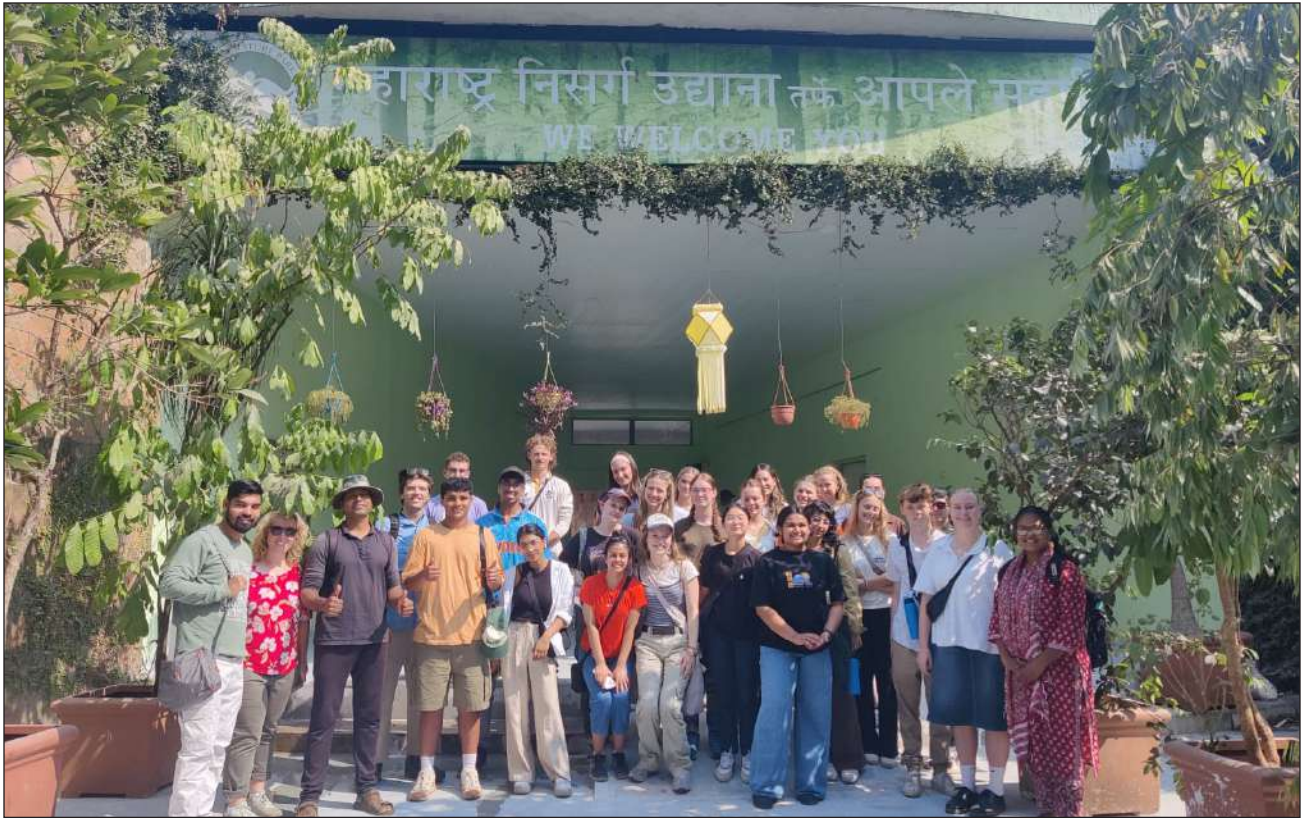
Students of Monash University on a field trip