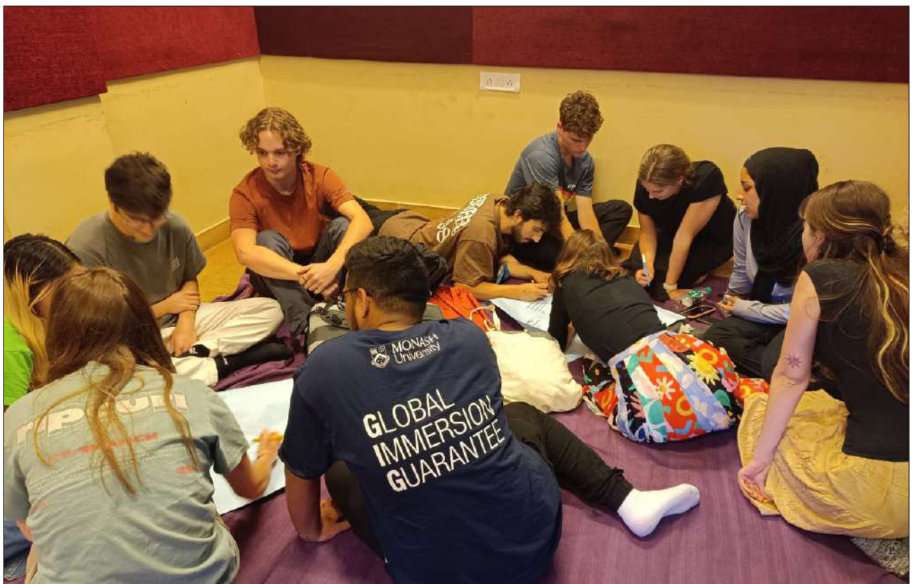
Monash University's CSIP group on an engaging field visit