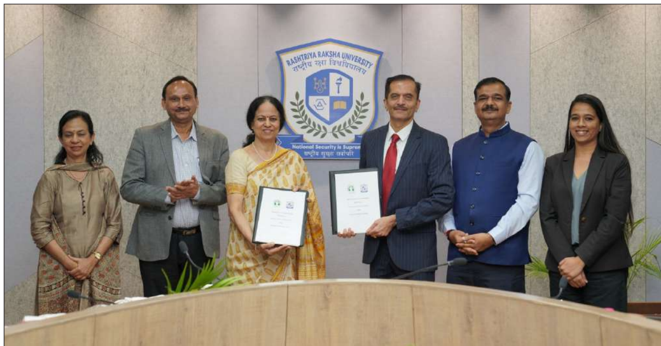
The MoU signing and exchange ceremony between TISS and Rashtriya Raksha University at Gandhinagar on 1 September 2023.