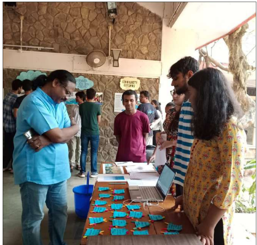
World Food Day celebrations at the Main Campus, TISS Mumbai.

express heartfelt gratitude to all the bravehearts who have made the supreme sacrifice; the 'Panch Pran' pledge; planting of saplings of Indigenous species and developing 'Amrit Vatika' (Vasudha Vandhan) and felicitation.